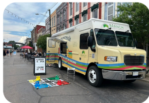
Hops On Monroe Coldwater