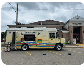
Bronson Polish Festival

November: The House in the Cerulean Sea by TJ Klune