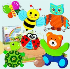
6-pack wood puzzles