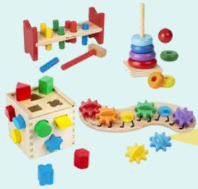
Educational toy 4-pack