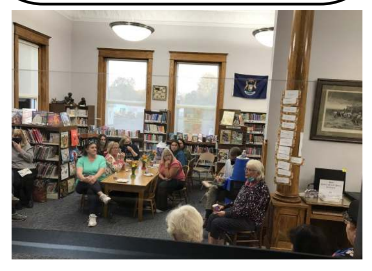
Friends of the Library met for their annual gathering at our branch in October. Most all branches were represented and wonderful treats from the Amish Goodie Shoppe were enjoyed. Tickets were drawn throughout the event for giveaways.