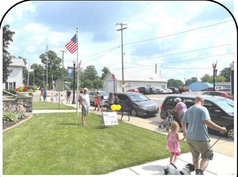
Children enjoyed the return of the Pet Parade, which fit perfectly with the summer "Tails or Tales" theme.