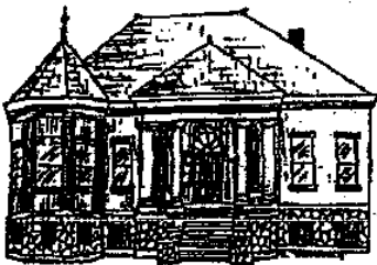
Quincy Public Library 1910

Non-Profit U.S. Postage Paid Permit No. 5 Quincy, MI