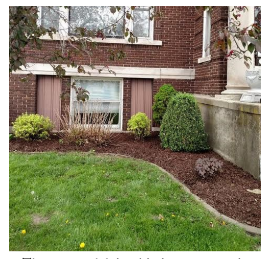
The new mulch is a big improvement!