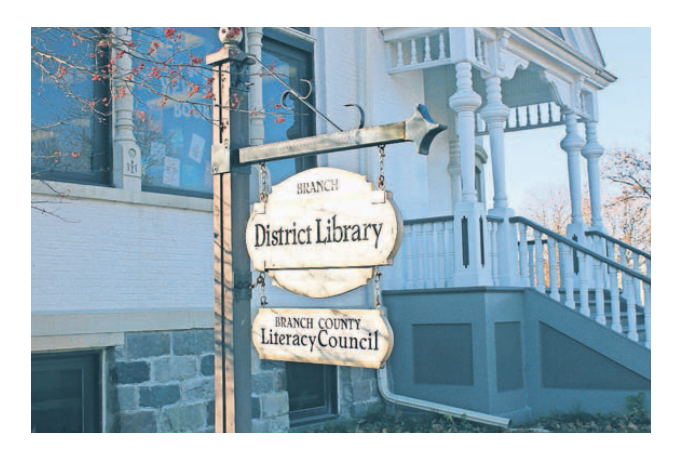
All branches of the Branch District Library will offer curbside-only service starting Monday.