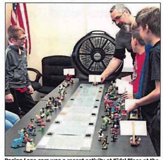
Racing Lego cars was a recent activity at Kids' Place at the Coldwater branch of the Branch District Library. [PHOTO

Coldwater, The Daily Reporter, December 19, 2019, page A6