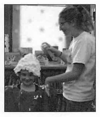
Tween Club shaving cream event at Kids' Place during Christmas vacation. [PHOTO PROVIDED]

luminary snow glow jars and a snack of cookies and hot chocolate.