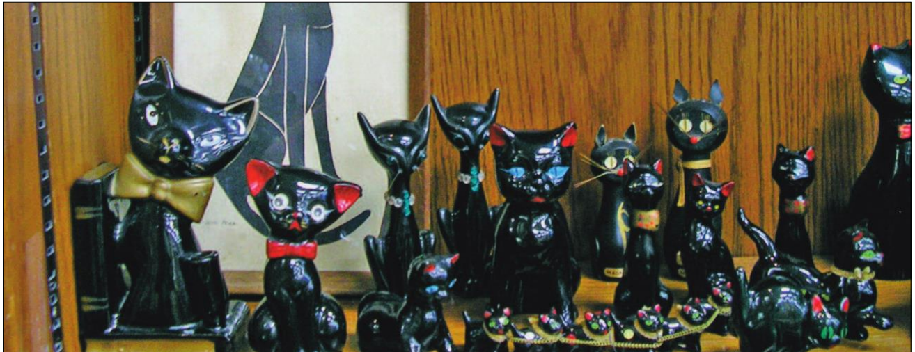
Black Cats from the private collection of Carol Omlor will be on display at the Coldwater branch of the Branch District Library for the month of November.