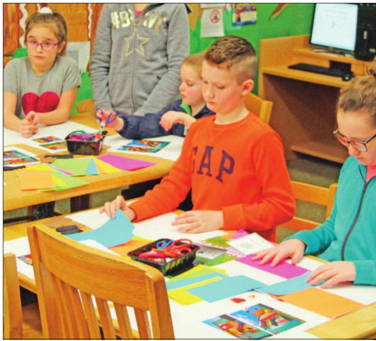
Local youth 'traveled' to Argentina Saturday during the Kiwanis Club of Coldwater's Traveling Tales events at the Coldwater branch of the Branch District Library's Kids' Place.

Coldwater Daily Reporter, February 28, 2018, page A1: