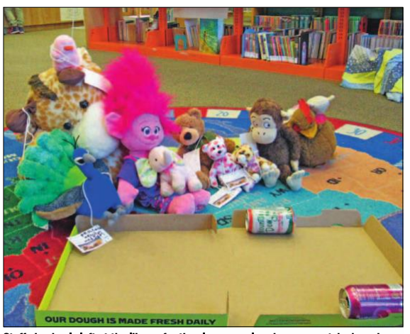
Stuffed animals left at the library for the sleepover played games, watched movies and more. The library will host a second sleepover event this summer.