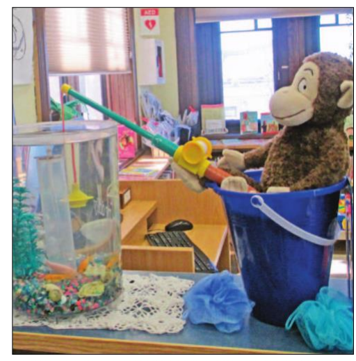
Stuffed animals left at the library for the sleepover had fun playing games, eating and even fishing at the Kids' Place.