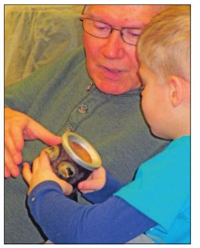
Kids were shown items, different types of foods and more from Argentina.

trictlibrary.org. The next Kids' Place event, Teddy Bear Story time and Sleepover, will be held from 10:30 to 11:30 a.m., Saturday.