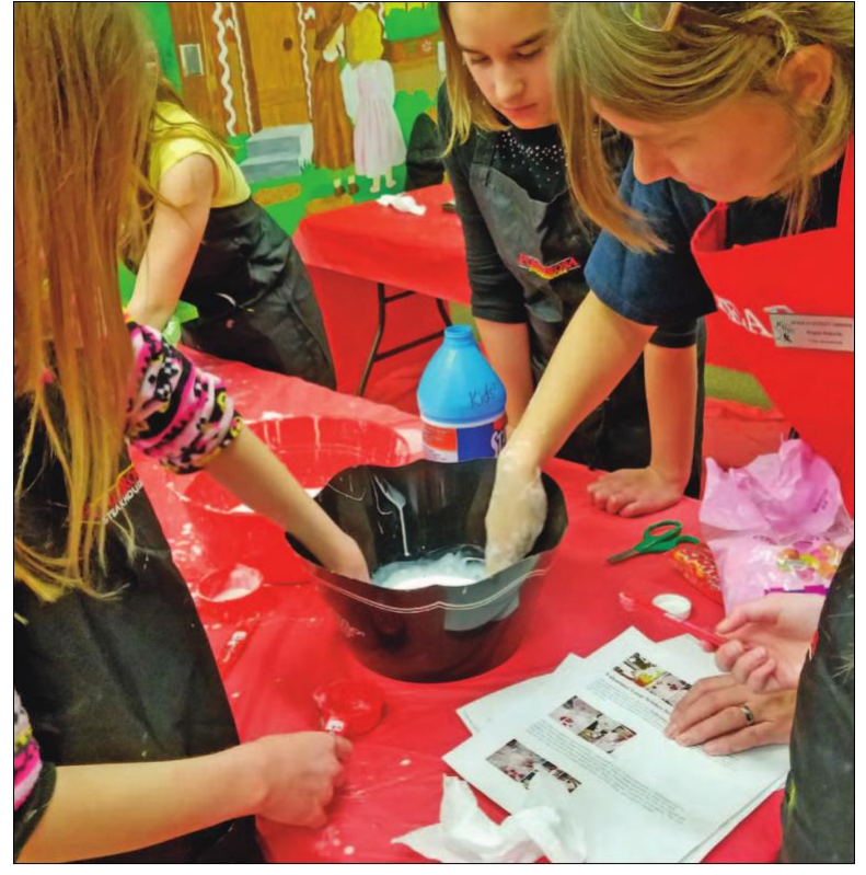
Above and below; Youth in the Kids' Place Tween Club experiment with various items at a recent meeting. The youth will meet on March 17 for St. Patrick's Day themed events.