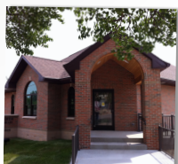
Union Twp. Branch