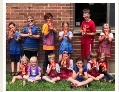
Nerf War @ Lucille E. Dearth Union Twp. Branch