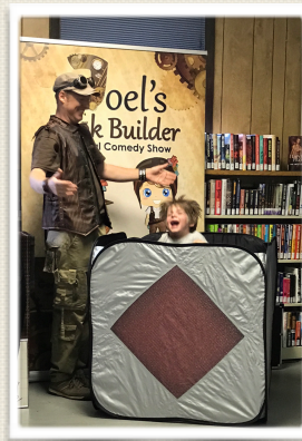
Summer Reading Fun @ Sherwood Branch