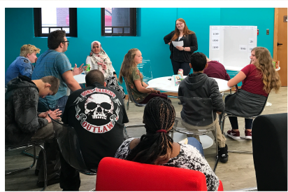
Teen Jeopardy @ Coldwater Branch