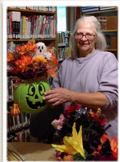
Fall Craft Time @ Alganssee Branch