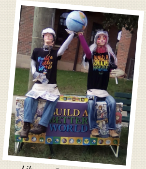
Library Scarecrows @ Union Twp.

*Your donation to the Branch District Library remains an itemized deduction on your federal income tax return.