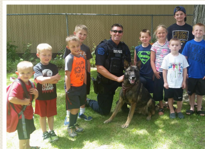
Michigan State Trooper Visit @ Quincy Branch