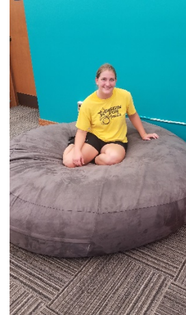
Amber Sunderland Bean Bag