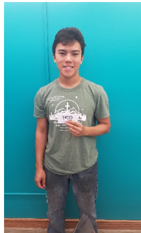
Ethan Machida Movie Package