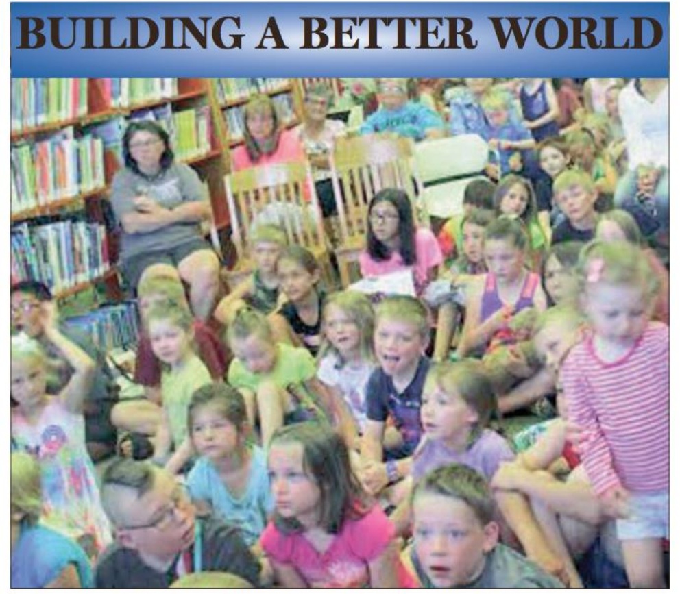
Coldwater branch of the Branch District Library Kids Place hosted over 100 guests during there first summer event. This year's theme is 'Building a Better World."