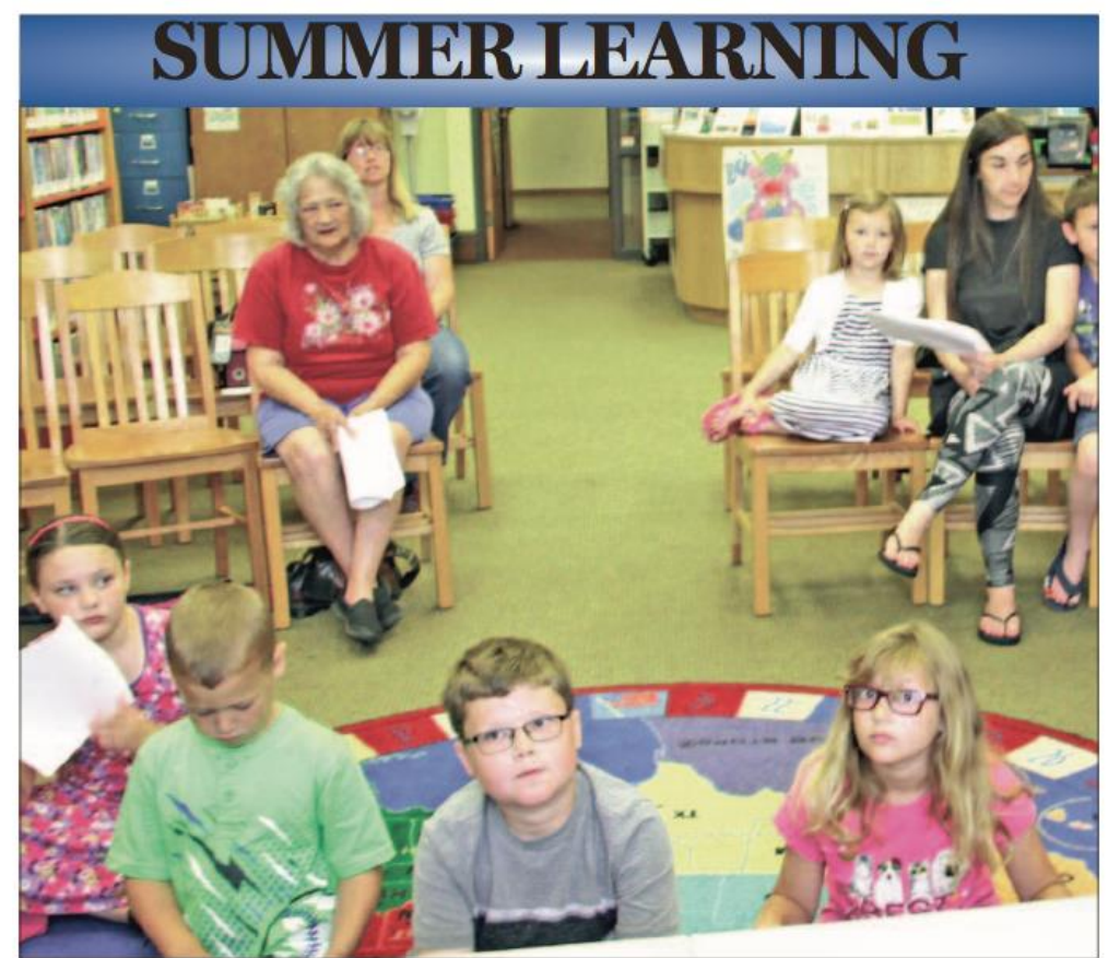
Children and parents gather at the Coldwater branch of the Branch District Library during the Summer Reading Program.