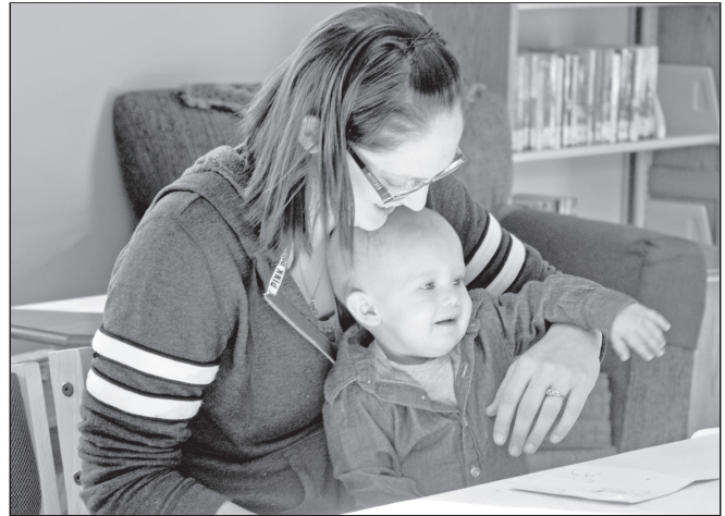
Children and adults who attended the “Eat Ice Cream for Breakfast” enjoyed ice cream sandwiches and card making during the event.