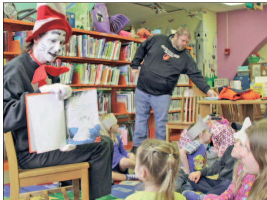
The Cat in the Hat visited the Branch District Library to read and do crafts with the children. His visit was a kick off to the “United We Read” initiative by the United Way.

This event kicked off the “United We Read” campaign across the nation. According to the Michigan Association of United Ways,