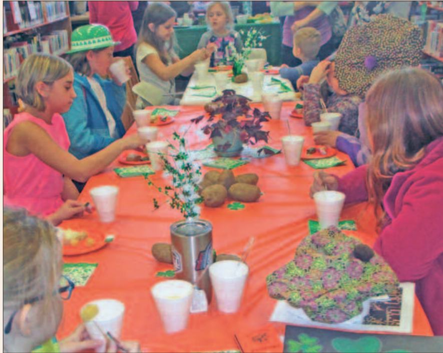
Kids craft shamrock art during the Kids Place "Traveling Tales" event Saturday.