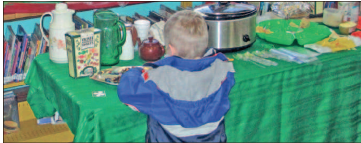
A young boy attending the "Traveling Tales" event Saturday at the Kids Place serves himself a helping of traditional Irish food.