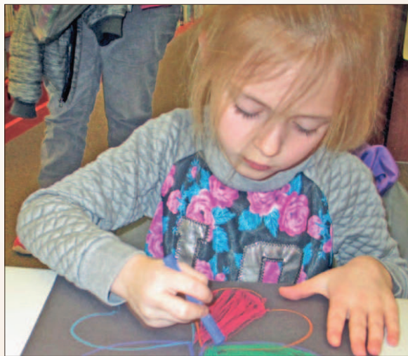
A young girl creates a shamrock during the Kids Place "Traveling Tales" event Saturday.