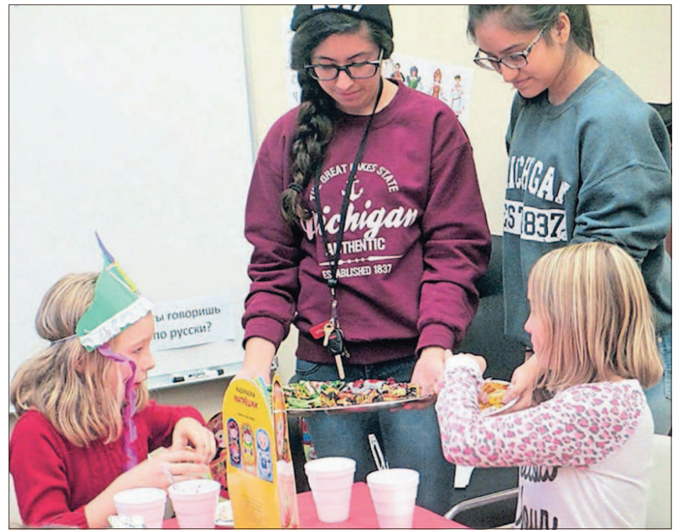
Kids' Place Traveling Tales takes local youth to Russia.