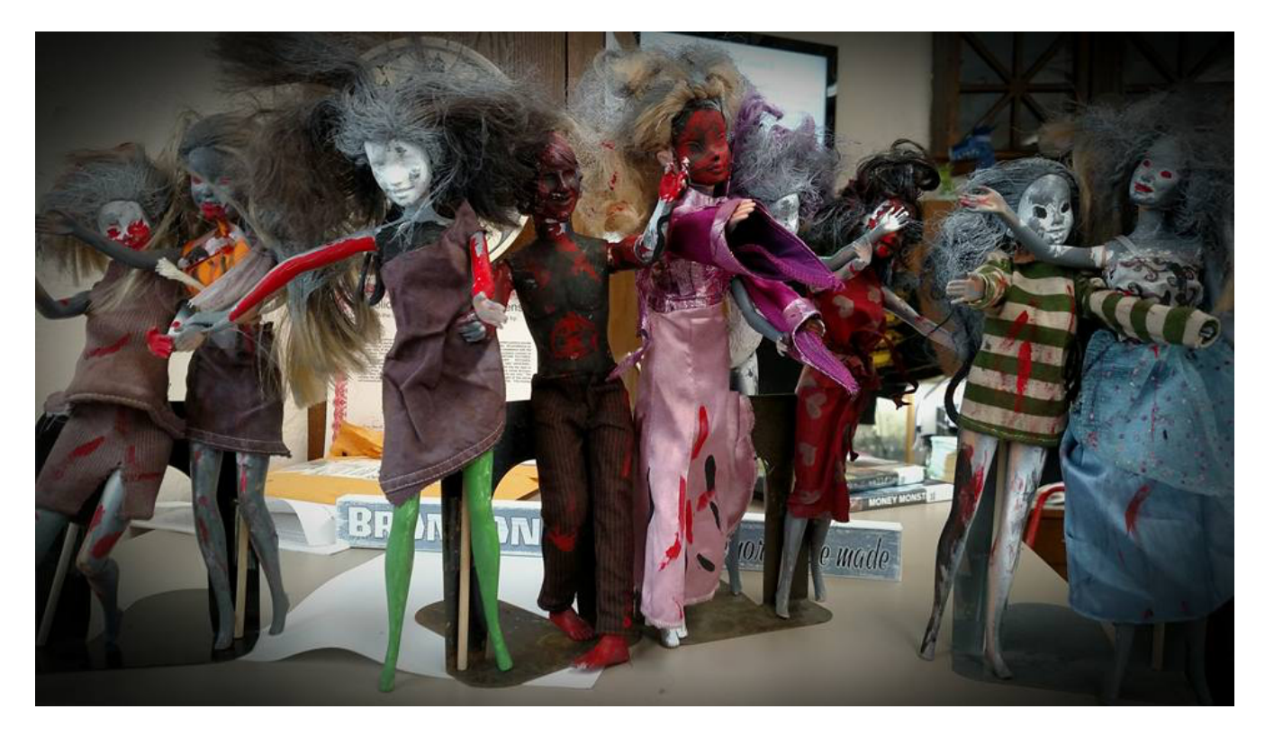
Tween and Teen Barbie Zombies in Bronson