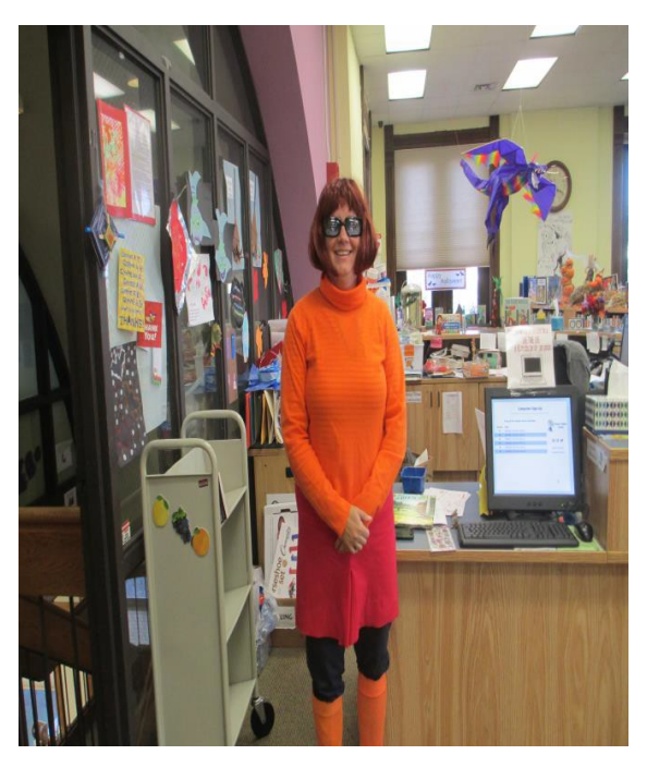
Where's Scooby, Thelma?