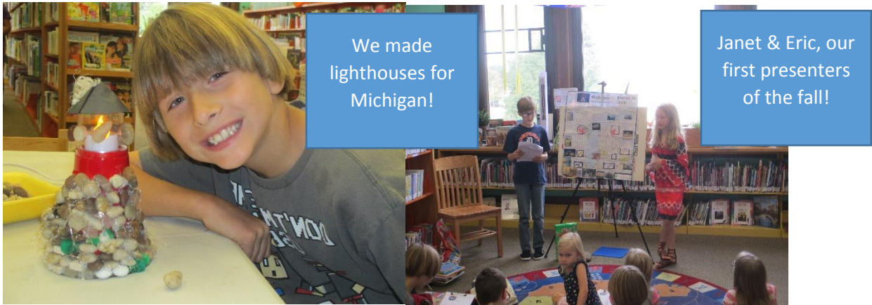
We made lighthouses for Michigan!

Home school Adventures are back on the road and we're exploring the USA each week.