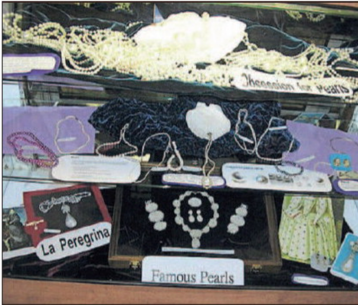
Diane Hoskins Pearl necklace collection is on display at the Coldwater branch of the Branch District Library throughout the month of April.