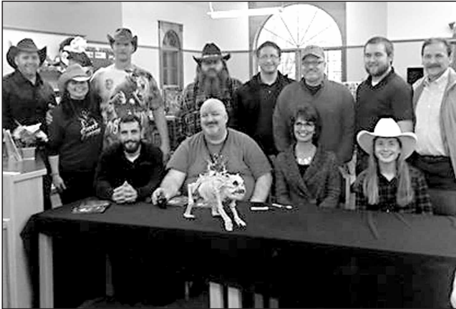
The Ghost Canyon cast

To take a look at the graphic novel Ghost Canyon, visit their website at ghostcanyon.com .