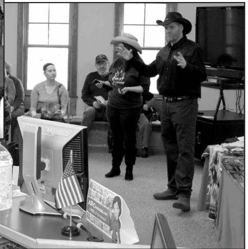
The creators of Ghost Canyon speak at the beginning of the release party.