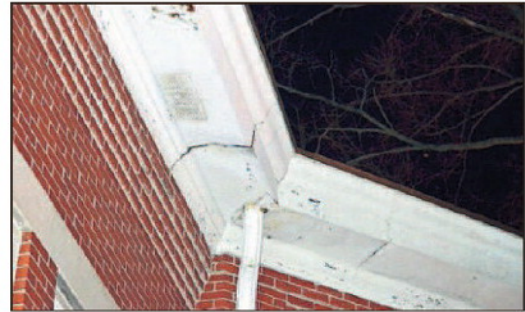
The sagging roof needs repair before gutters can be fixed at the Quincy Library.

“Kids are getting down in there and using it as a place