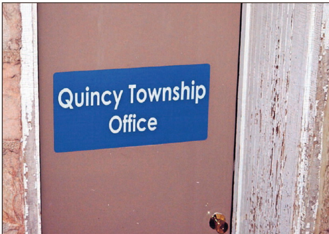
The rotted wood door frame at the Quincy Library.