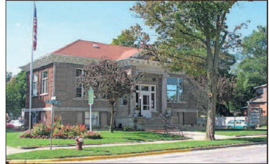
Bronson Branch Library has many events coming up.

BRONSON – The Bronson branch of the Branch District Library has a full schedule of events for the whole family.