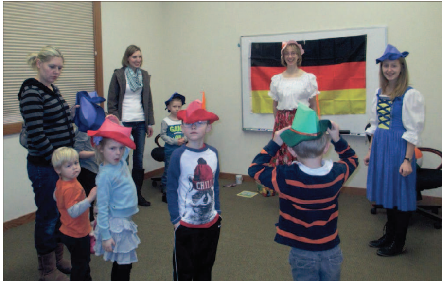
Local youth learn about German culture through songs, dance, crafts and food.

Through the Kiwanis Club Traveling Tales adventure, local youth traveled to Germany with the Grimm's Brothers tale: "The Bremen Town Musicians".