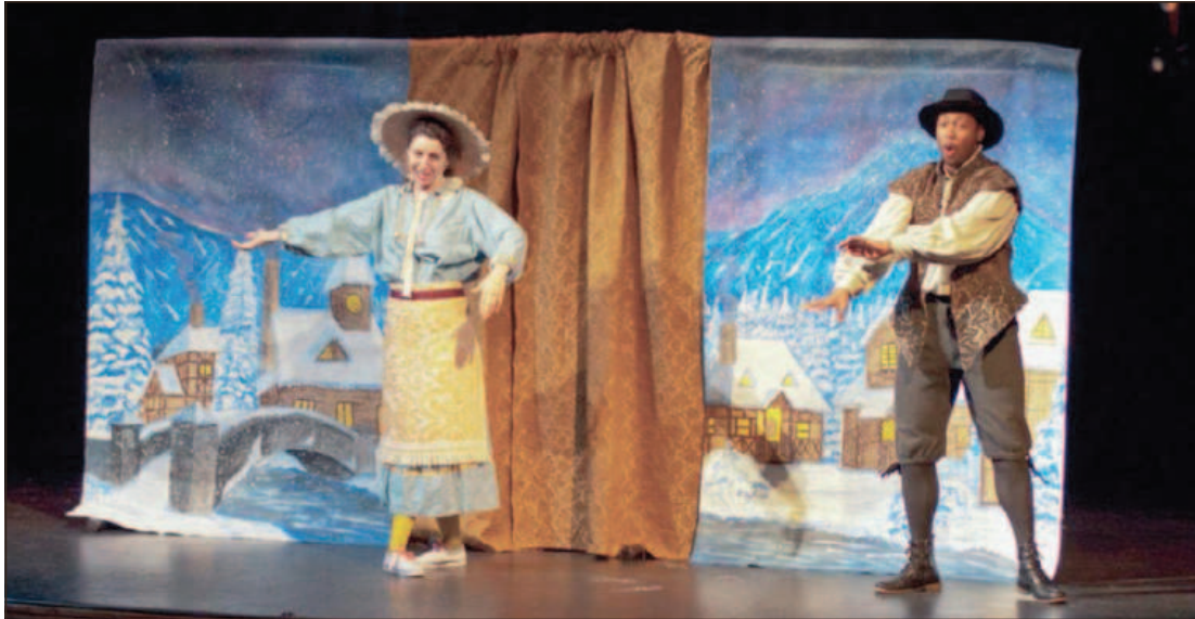
Coldwater Noon Rotary sponsors Winter Fables performed by Bright Start Touring Group.

Coldwater Daily Reporter , Tuesday, February 2, 2016, page A3: