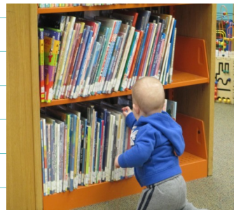
Some patrons prefer to choose their own materials!

Can't wait to see how many books/pages will be read as we "Fall into Reading!"