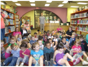
SOME OF OUR VISITORS FROM THE LINCOLN HEADSTART

The end of May brought more than summer temps! Kids' Place heated up with approximately 125 pre-schoolers from a number of local Headstart classes. The students walked here from both the Lincoln and Franklin schools! Fortunately the days of their visits were sunny!