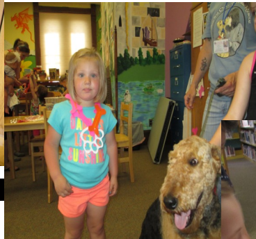
Preschool storytime with Jade the therapy dog.

"At the moment that we persuade a child, any child, to cross that threshold, that magic threshold into a library, we change their lives forever, for the better. It's an enormous force for good. Senator Barack Obama