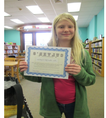
in the middle.