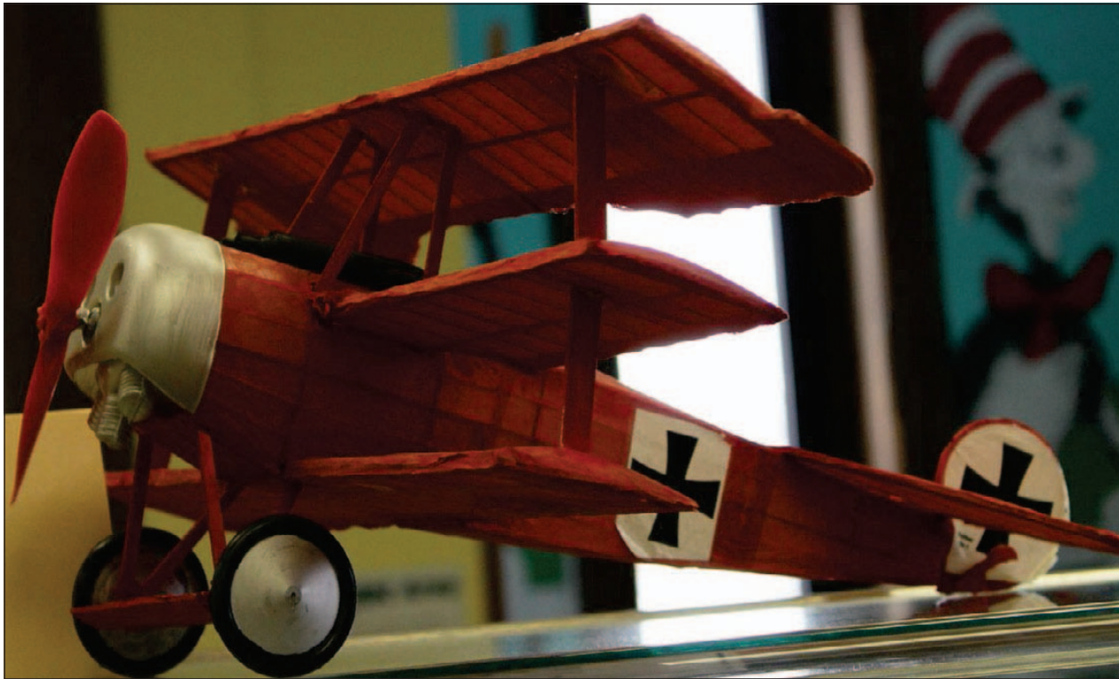
Donald Dull's hand crafted German Fighter Plane is on display at the library.