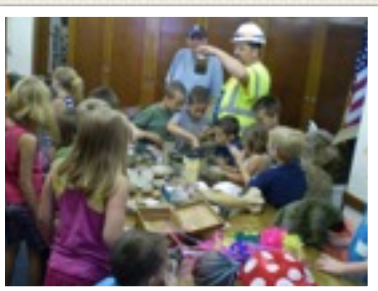
Kalamazoo Nature Center @ Quincy Branch