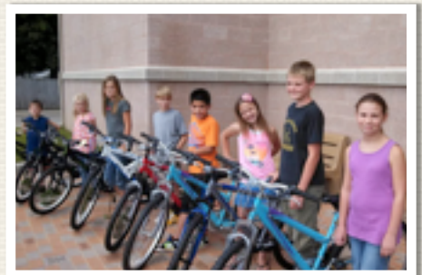
Summer Reading Program Winners @ Bronson Branch