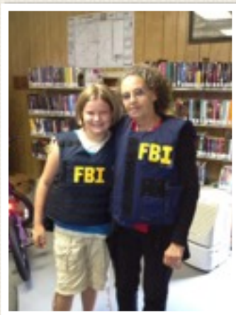
FBI Visit @ Sherwood Branch