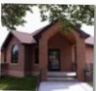
Union Twp. Branch