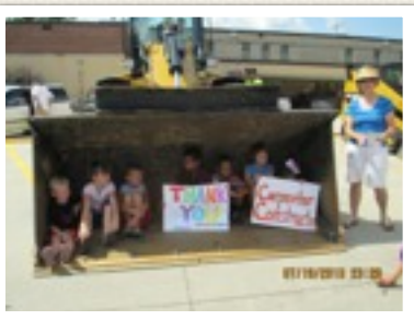
Touch-a-Truck Petting Zoo @ Coldwater Branch

*Your donation to the Branch District Library remains an itemized deduction on your federal income tax return.