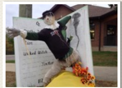
We Geek Halloween @ Lucille E. Dearth Union Twp. Branch